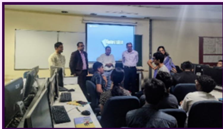
Glimpses of the informative session on pepper Contest by Pantherun Technologies

6. Informative Session on Pepper Contest by Pantherun Technologies: On 17 June an informative session was organised in the university School of ICT on upcoming Pepper Contest by Pantherun Technologies India. The contest offered a vibrant platform for students to showcase their talents in key domains such as AI, cybersecurity, embedded systems, and networking.