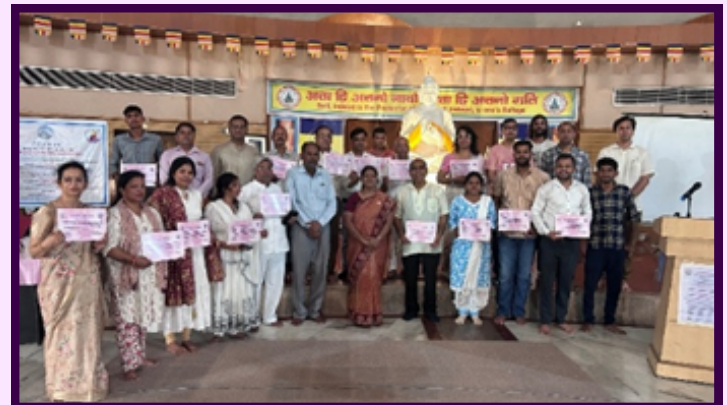
Participants of the Vipassana Workshop with Certificates

retreat turned out to be a meaningful and transformative mindfulness journey, guiding participants towards self-growth.