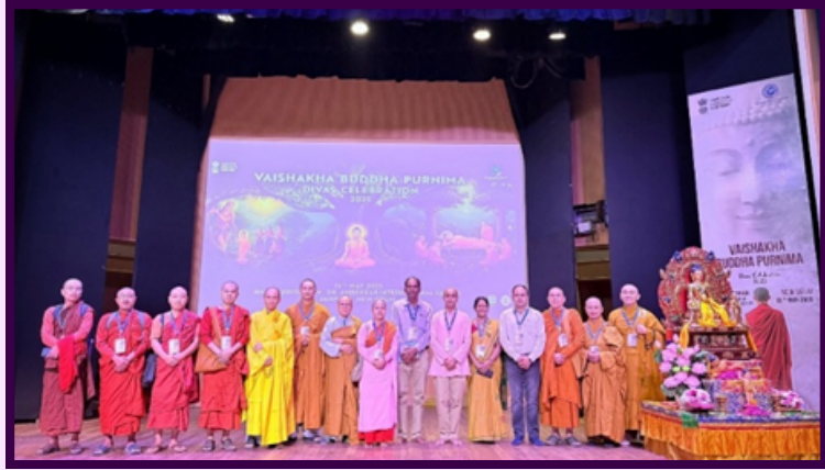
Faculty and Students of the Department of Buddhist Studies and Civilization at the Vesak Day Event Organized by the International Buddhist Confederation, New Delhi

3. Participation in event in International Buddhist Confederation: On 15th May, the faculty and students of the Department of Buddhist Studies and Civilization participated in the Vesak Day (Buddha Purnima) celebrations organized by the International Buddhist Confederation in New Delhi.