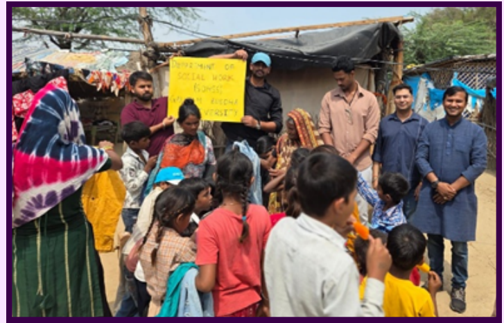
Faculty and students of the Department of Social Work donating clothes to the villagers