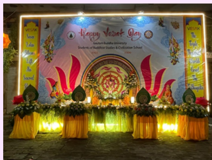
Vesak day celebration

1. Buddha Purnima Celebration: On the occasion of Vesak Day, a grand celebration of Buddha Purnima was organized at the university by the students of the School of Buddhist Studies and Civilization. It included participants from Vietnam, Myanmar, Laos, and India. Considering the ongoing examinations, the celebration was held on 3rd May instead of the actual date, 12th May. On this occasion, students took out a procession with the statue of Lord Buddha on the university campus. Buddha Purnima commemorates three significant events in the life of Lord Shakyamuni Buddha – his birth, enlightenment (Dhammachakkappavattana), and Mahaparinirvana (passing away). This sacred day symbolizes compassion, wisdom, and liberation.