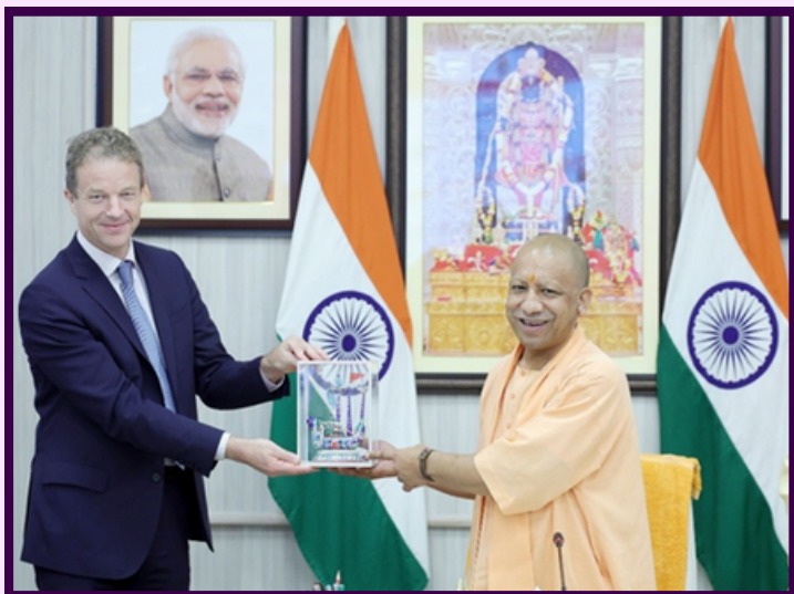
CM. Yogi Adityanath and Monash University representative formalizing a landmark academic partnership

1.Uttar Pradesh Government Partners with Monash University & GBU Named as Key Implementation Hub: On May 29, Chancellor of Gautam Buddha University and Uttar Pradesh Chief Minister Yogi Adityanath presided over the signing of a significant Memorandum of Understanding (MoU) between the UP Government and Monash University, Australia, in Lucknow. The agreement aims to foster international collaboration in education, research, and capacity-building across all levels of education in the state.