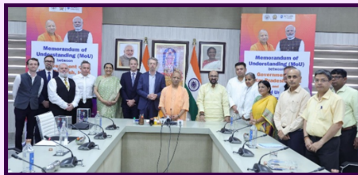
Glimpses of the MoU signing event

A key feature of this initiative is the appointment of Gautam Buddha University as the nodal implementation partner. GBU will coordinate joint programs with Monash University, including curriculum development, teacher training, research projects, and student exchanges, thereby strengthening UP's global academic engagement. The Chief Minister highlighted that education is not merely about degrees but a fundamental pillar of development, and this collaboration is in line with India's National Education Policy 2020, which advocates international partnerships and interdisciplinary learning.