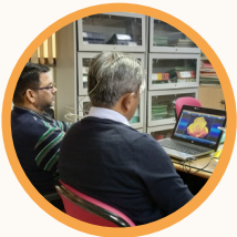
Neural Entrainment Lab