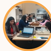
Applied Psychology Lab