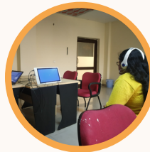
Brain Finger-printing Lab