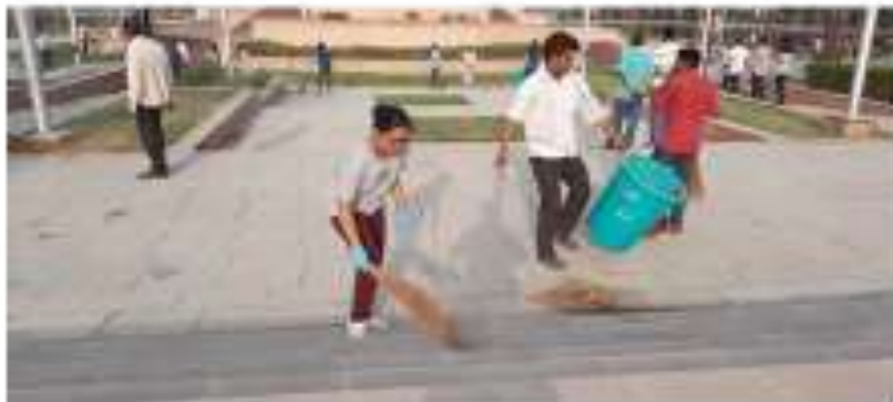
Swachhta Abhiyaan at GBU