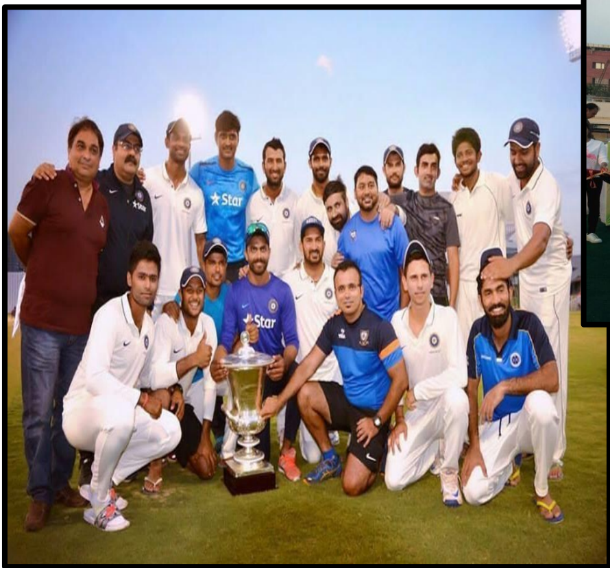
INDIA BLUE TEAM DULEEP TROPHY