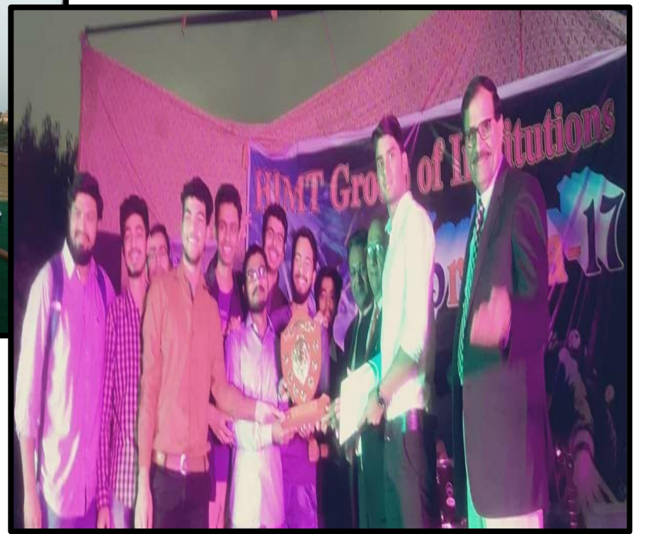
HIMT Sports Fest