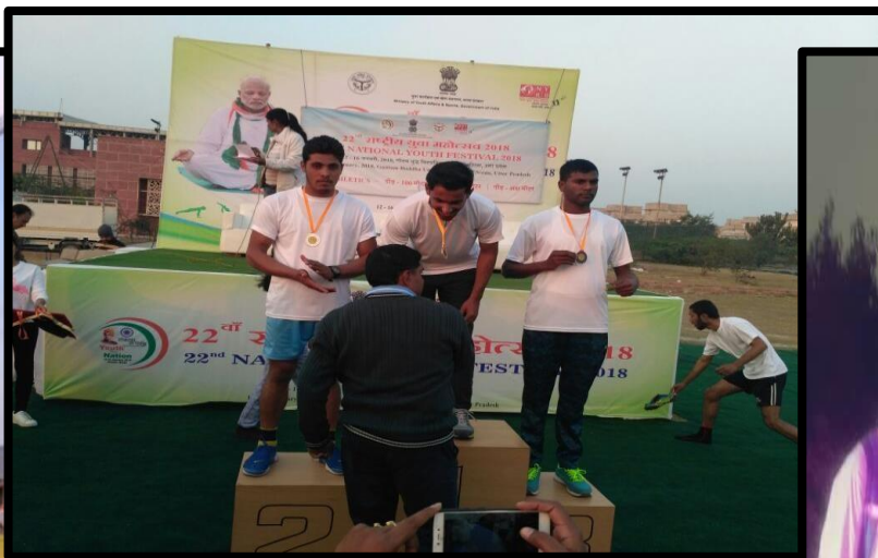
National Youth Festival