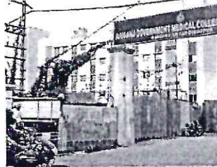
Good learning centre at Golu, another has been made functional at the Islampur polytechnic college. We have arranged for 150 isolation