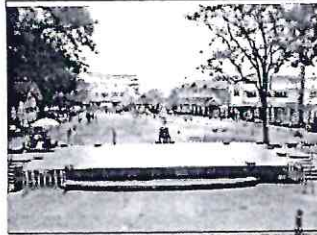
STATESMAN NEWS SERVICE DARJEELING, 6 JANUARY

Three tourists, many locals down in Darjeeling